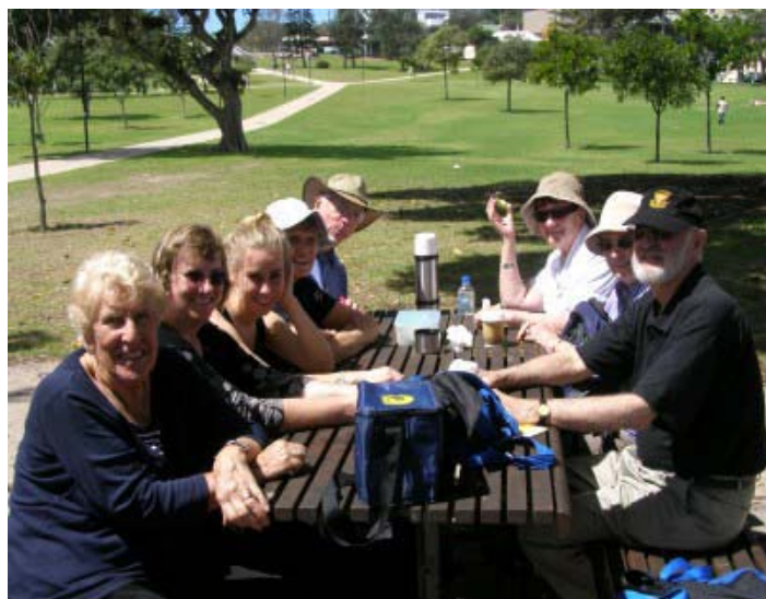
Some dined inside, others picnicked