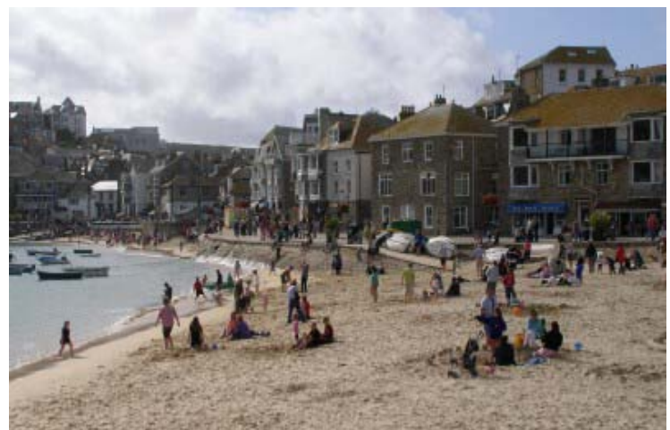
Views of the harbour

A tradition revived by the Old Cornwall Society is the Midsummer Eve Bonfire when a Lady of the Flowers casts herbs into a hilltop blaze and prayers are said in the Cornish Language. It recalls the old Celtic ceremony of the Belthane Fires that the early church Christianised but was moved from May to mid-summer.