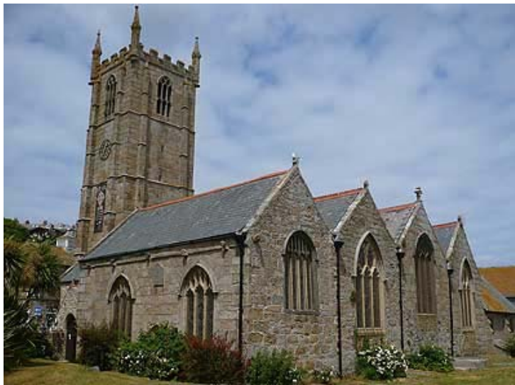
The Parish Church of Saint Ives

Feast Day always falls on the first Monday after February 3rd, the anniversary of the consecration of the Parish Church of St., Eia in 1434. Lelant Feast is on February 2nd and in earlier times it was the custom for St. Ives to play Lelant in the famous 'Hurling' of the silver ball, a kind of naturalistic rugby march, retained by other notable towns like St. Columb near Newquay.