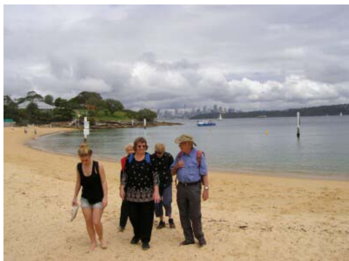
The small band who did the loop walk earlier at Camp Cove