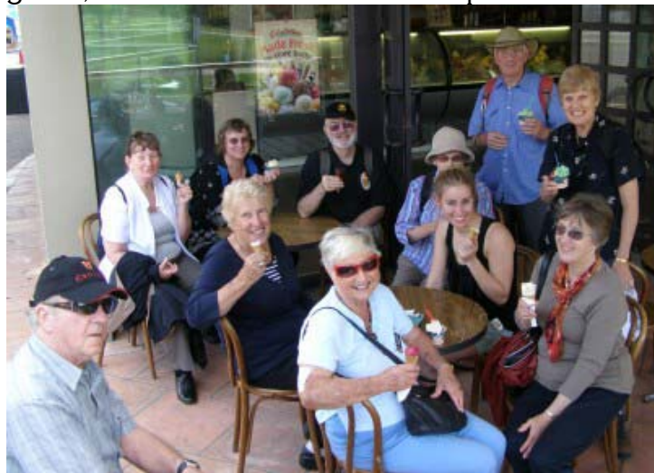
11 out of the 13 who enjoyed the day out - having a gelato

Despite threatening forecasts in the morning, and a few late withdrawals we made our way into Circular Quay and on to the Watson's Bay ferry. A small group did the walk around Camp Cove and to South Head and Hornsby Light. Then we met up with the others for lunch, chats, a yummy gelato, and a reflective look at the Gap.